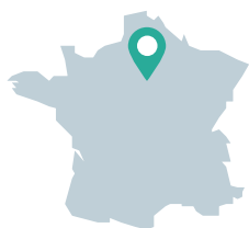
IP Paris campus in Palaiseau

Télécom Paris is the French leading school in digital technology. This public institution is recognized for its strong links with companies, ensures excellent employability rates in all sectors and is ranked number one among major engineering schools for digital technology. Offering excellence in teaching and innovative educational methods, Télécom Paris is at the forefront of a unique innovation ecosystem founded on cross-disciplinary and interactive training, interdisciplinary research, incubators and accelerators for start-ups, and several campuses (Paris, Sophia Antipolis, Shanghai). The school's laboratories have been recognized as leading forces in the fields of digital science, with remarkable international standing, impressive business volumes with the socioeconomic and corporate worlds, and a strong commitment to training.