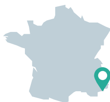
Eurecom campus in Sophia Antipolis