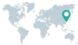
SJTU-ParisTech Elite Institute of Technology campus, in Shanghai

Founding member of Institut Polytechnique de Paris